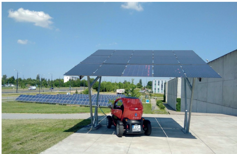
Fig. 1. Charging a vehicle from a photovoltaic carport

Figure 1 shows the Renault Twizy during the process of charging its batteries from a photovoltaic carport.