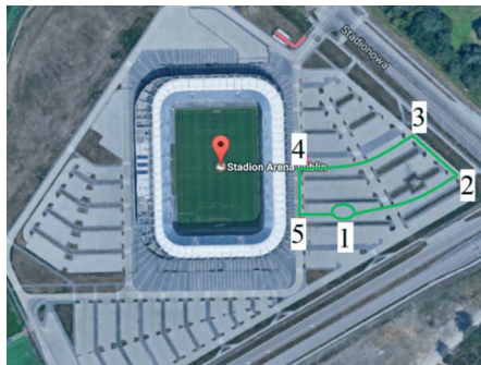
Fig. 3. The route of the car during the research

During the tests in motion, the method of observing the surroundings during the manoeuvres of changing the direction of movement to the left was analysed. The time of “distraction” was determined on the basis of the analysis of the time of focusing attention on the left side mirror. The parameter taken into account during the study was also the number of glances in this direction. The research group consisted of 5 people aged 23–25 (two women, three men). Each person had a category B driving license and, according to the statement, had no visual impairments. The task of the tested people was to drive the designated route, on which there were places where the person supervising the tests (located inside the vehicle) ordered the manoeuvres in advance. The study was conducted in the parking lot of the Arena Lublin stadium in Lublin. The car was moving along the alleys, between the parking spaces. During the tests, other vehicles were also moving in the parking lot. An example of the route is marked with a green line in Figure 3. The number “1” marks the start and end of the ride, the numbers “2–5” mark the places where the left turn was made. The test persons covered the given route twice. Thus, eight measurements were collected for each person.