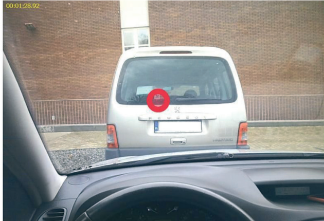
Fig. 1. Frame of video recorded by the SMI Eye tracker system

In order to determine the value of the time necessary for the recognition and interpretation of the situation by the driver, experimental studies were carried out in various areas. They assume that the “basic” task of the driver is to observe the surroundings in front of the vehicle. During the tests, it was the subject’s responsibility to observe the surroundings through the windshield (main area) and to perform activities requiring temporary focus of attention and shifting the gaze beyond this area. The way in which the examined person conducted the observation was determined on the basis of the analysis of the temporary position of the eyeball. In order to monitor it, the SMI Eye tracker system was used, which consisted of glasses equipped with a camera system, a clock indicating time with an accuracy of 0.01 s and a video recording device. The temporary position of the eyeball during the examination was marked by the system with an indicator (Figure 1). The recorded video record was subjected to analysis, during which the total time elapsed from the pointer’s movement outside the windscreen area to another area to its return to the “main” observation area was determined. The value thus determined is referred to as ‘driver distraction time’.