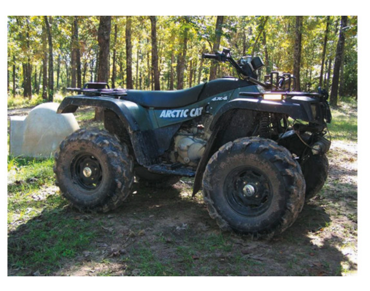
Fig. 8. Vehicle

The vehicle 4 was powered by an air and oil cooled, four-stroke, two-cylinder engine with a displacement of 366 cc,. It was equipped with an automatic, five-speed gearbox with an additional off-road gear. The curb weight of the ready to run vehicle was 316kg (without driver). The power was transmitted to two or four wheels by the means of a drive belt. The vehicle was equipped with a single disc brakes on each axle. During the test run the vehicle was equipped with off-road tires: 25/8-AT11 – front and 25/10-AT9 – rear. The general view of the vehicle 4 is shown in Figure 8.