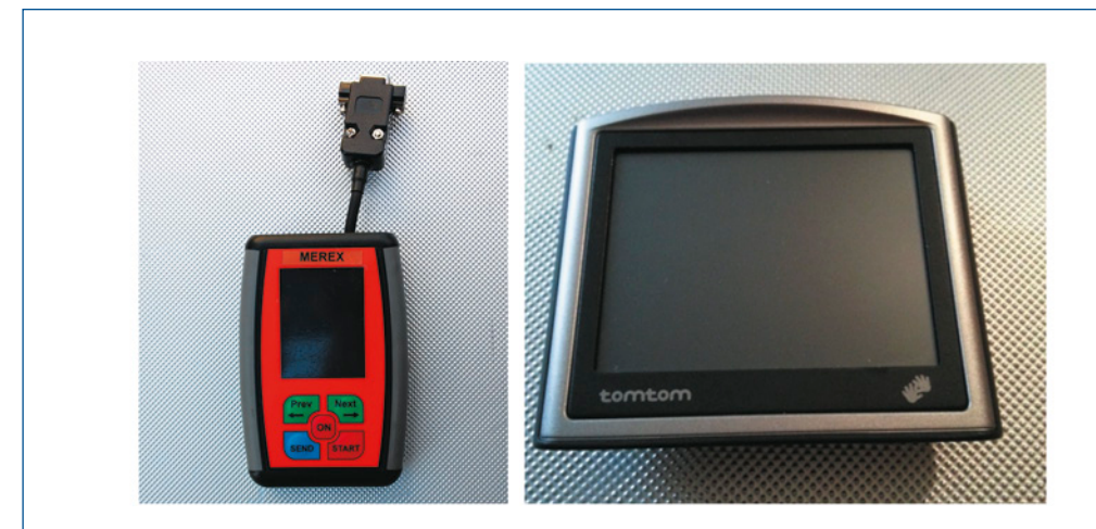
Fig. 3. MEREX recording device (on the left side) and Tom Tom device (on the right side)