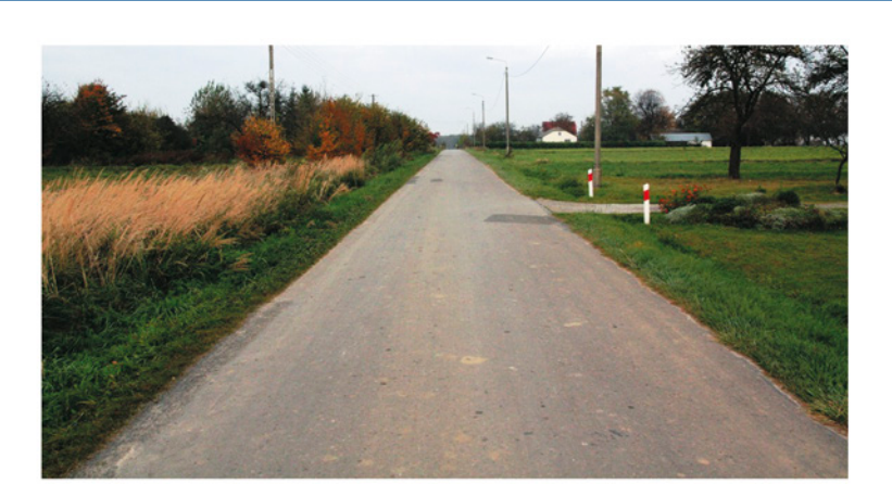
Fig. 1. Asphalt surface - a place of research

height was approximately 190 cm. His task involved performing the planned maneuvers with the application of maximum possible force pressure on the brake levers (during braking) and the maximum throttle opening (during run-up). When testing the acceleration of vehicles equipped with manual transmission, it was assumed to perform the maneuver without any change of gears.