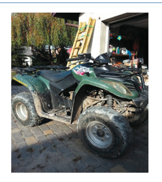
Fig. 5. Vehicle 1

The vehicle 1 was powered by an air-cooled, four-stroke, single-cylinder engine with a displacement of 149 cc, equipped with an automatic continuously variable transmission (CVT). The curb weight of the run vehicle was 185kg (without driver). Power was transmitted through a chain to the rear wheels. The vehicle was equipped with two drum brakes on the front axle and a single, ventilated disc brake on the rear axle. During the test run the vehicle was equipped with off-road tires: 21/7-AT11 – front and 22/10-AT9 – rear. The general view of vehicle 1 is shown in Figure 5