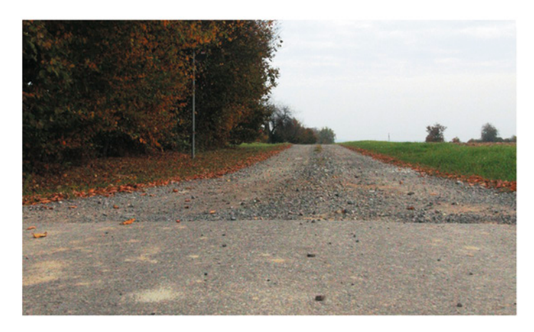
Fig. 2. Ground surface - a place of research